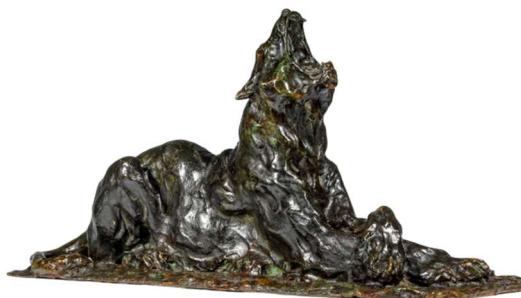
Rembrandt Bugatti, (Italian, 1884-1916), Lioness Yawning , 1903, Bronze