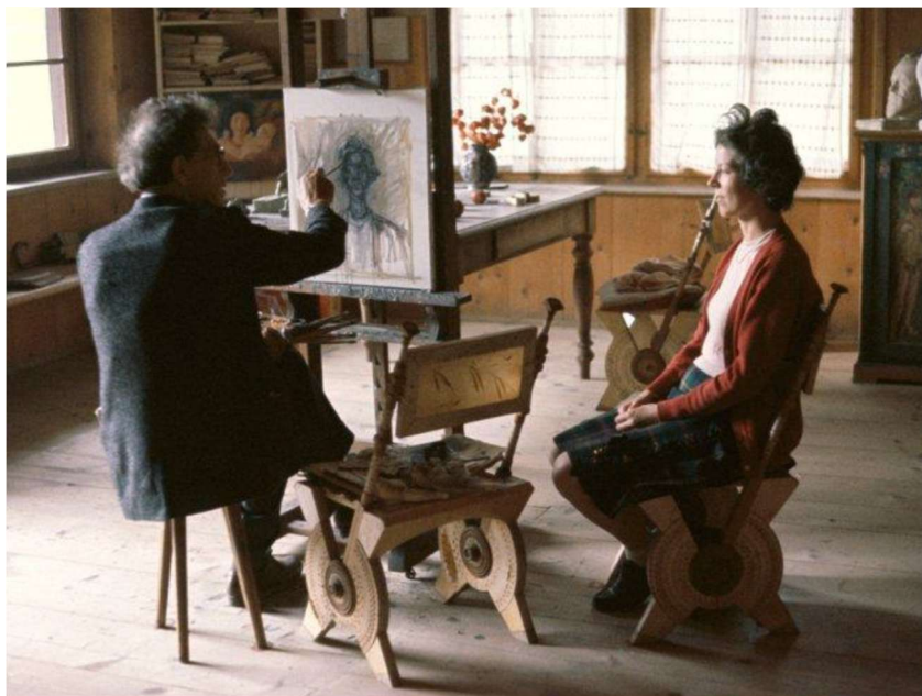
The artist Alberto Giacometti in his studio in Stampa, Switzerland

The display will feature a chair and desk, circa 1904 made by the Italian designer for his long-time friend Giovanni Giacometti , painter and father of Alberto Giacometti. The set created in Carlo's distinctive and instantly recognisable style, with abundant use of parchment and painted decorations, was a central piece of the Giacometti's studio in Stampa, Switzerland and is recorded in several paintings by Giovanni and Alberto. The exhibition will also include a rare silver tea set – unique for the period and a testament to both Carlo's inventive imagination and his rapid mastery of working with silver.