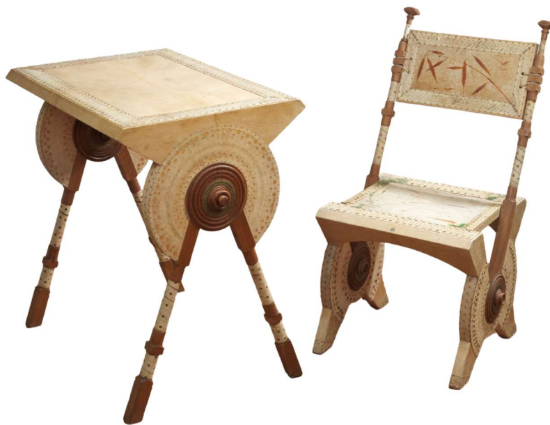
Chair and desk, circa 1904 made by Carlo Bugatti for his long-time friend Giovanni Giacometti, and thereafter in the studio of Alberto Giacometti