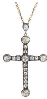
A fine English diamond cross pendant, circa 1780. © Sandra Cronan, London. Photo: Richard Valencia