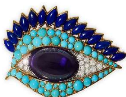
A gem-set eye brooch by Cartier, circa 1950