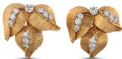
A pair of Cartier gold and diamond clips of stylised leaf design. American, circa 1940