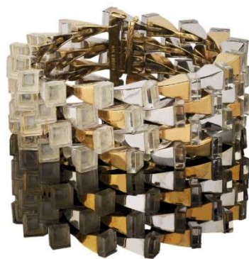
The Rock crystal and gold 'Crystal Stairs' bracelet designed for Cartier New York in 1970 by Aldo Cipullo, the man behind the Love Bracelet