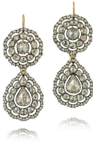
A pair of extremely rare rose cut diamond pendant earrings. English/French, circa 1750.