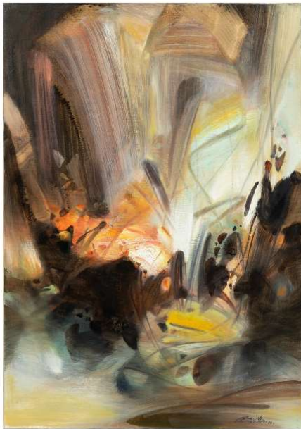
Chu Teh-Chun, Luminosité résonante I, 1988, 3812 Gallery