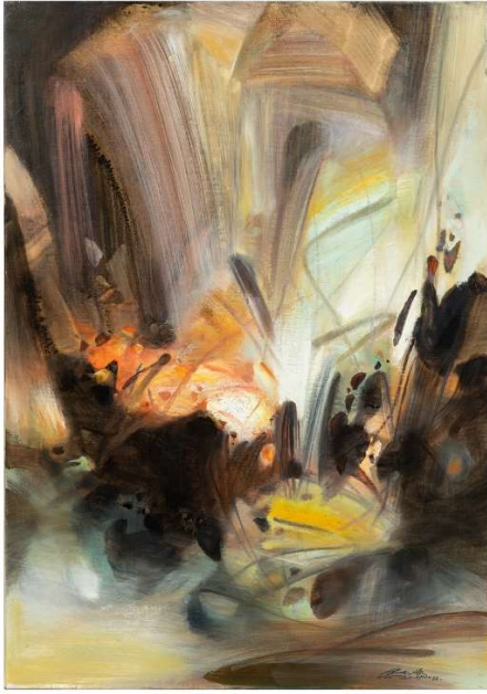
Chu Teh-Chun, Luminosite résonante I, 1988, 3812 Gallery