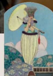
FROM TOP: BERNARD GOLDBERG FINE ARTS - LEROY WOMAN WITH PARASOL

For more information, visit treasurehousefair.com