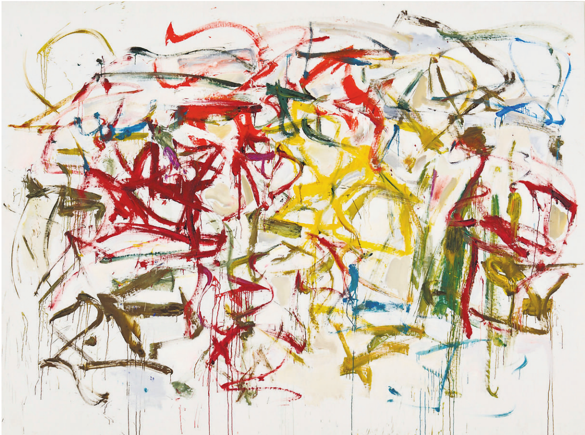
JOAN MITCHELL FOUNDATION