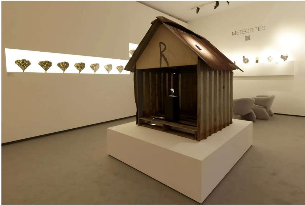
LONDON, ENGLAND - JUNE 25: Preview of the Treasure House Fair, taking place at the Royal Hospital Chelsea on June 25, 2025 in London, England.

The Aguas Zarcas meteorite—a rare carbonaceous chondrite that lit up the Costa Rican sky in 2019 before crashing through a doghouse—is the star of the ArtAncient booth. Alongside the meteorite, the damaged doghouse itself is on display, offering a cosmic twist to the fair’s blend of art, science, and storytelling.