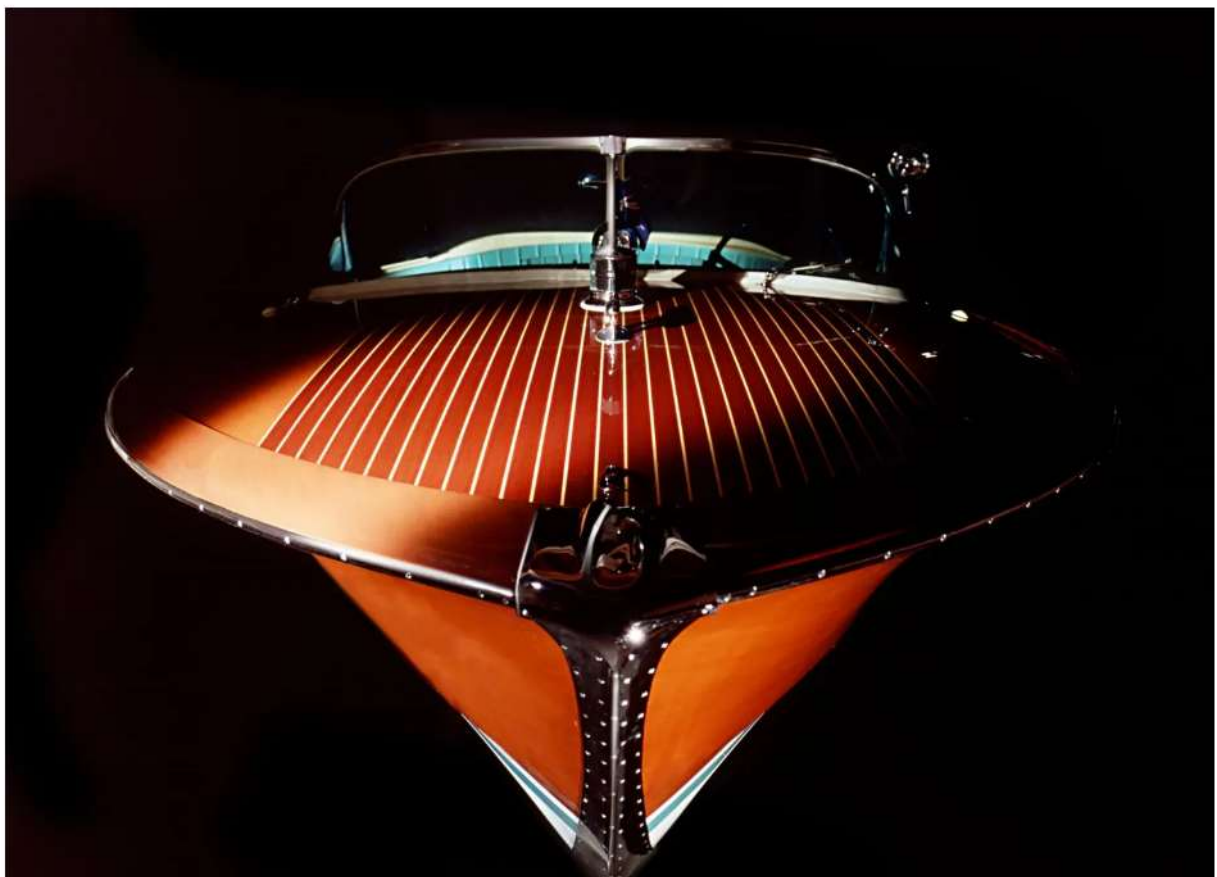
Riva Ariston – Italian Icon of Nautical Design

Presented by Ventura UK at Treasure House Fair, the Riva Ariston is a symbol of mid-century glamour, famously favoured by film stars and royals from Sophia Loren and Brigitte Bardot to Princess Grace of Monaco and King Hussein of Jordan. Built between 1950–1976, this sleek mahogany speedboat epitomises Italian craftsmanship and timeless style and has been immortalised on celluloid from Italian cinema to James Bond, remaining a coveted collector’s item.