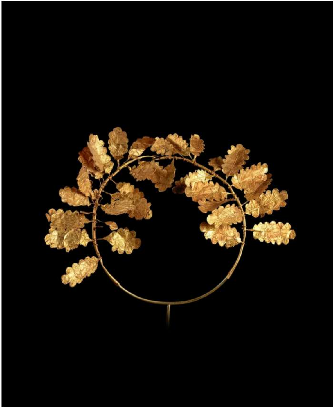
An Ancient Greek gold oak wreath Late Classical to early Hellenistic, circa 4th - 3rd century BC L. 35.8 cm, W. 37 gr

Debuting at the fair, Kallos Gallery showcases a curated selection of Ancient Greek, Roman, and Egyptian treasures. Highlights include a gold oak wreath from the 4th century BC, a feline Egyptian deity, and a bust of Helios with contemporary gold sun rays. The gold wreath was sold for £85,000 on opening night.