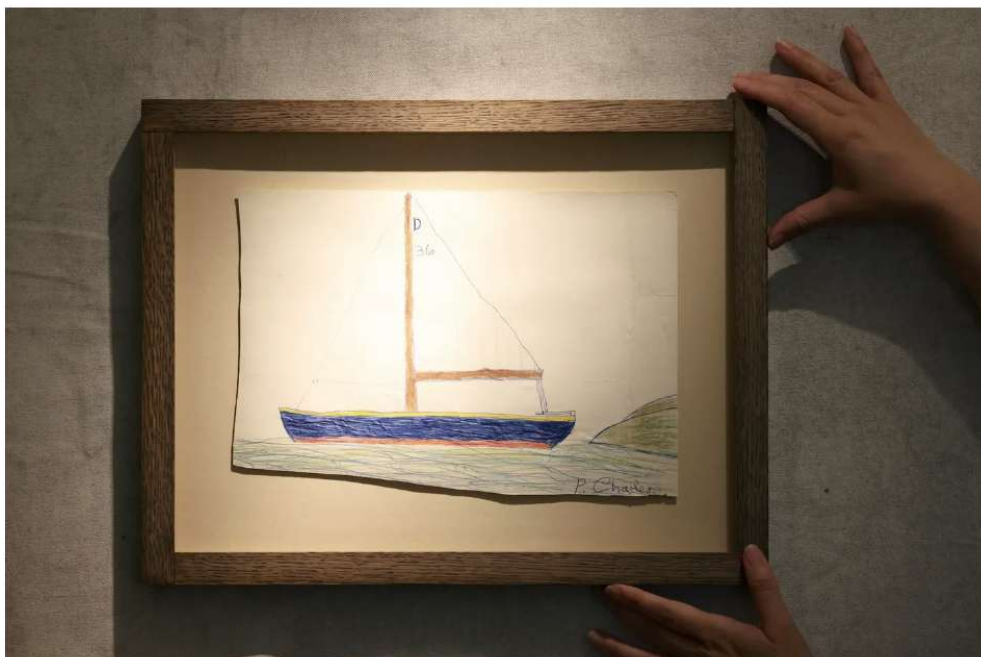
His Majesty King Charles III Dragon boat in full sail, circa 1957 Blue ink and coloured crayons on paper Signed 'P. Charles' lower right. 13" high x 17" wide (Framed) Presented by Robert Young Antiques, London