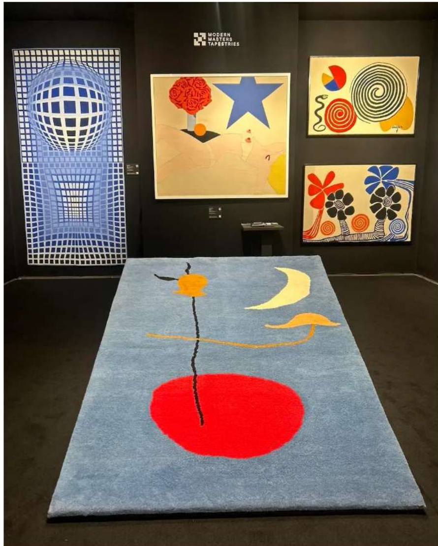
Modern Masters Tapestries booth at Treasure House Fair.

Modern Masters Tapestries are the star of BOCCARA Gallery 's showcase featuring vibrant textile works by Modernist and Pop Art icons such as Tom Wesselmann, Joan Miró, Victor Vasarely, Sonia Delaunay, and Alexander Calder. These handwoven pieces celebrate the enduring legacy of Aubusson weaving through the lens of 20th-century art movements.