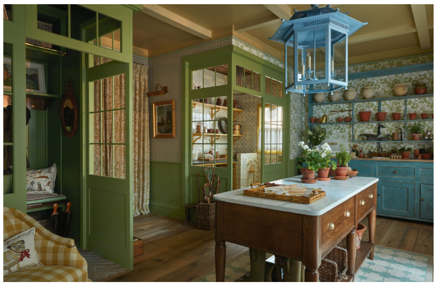
Above: The Sims Hilditch Courtyard Room by Emma Sims-Hilditch. Below left: The House of Rohl Primary Bathroom by 1508 London. Below right: The Phillip Jeffries Study by Staffan Tollgård, with its striking 'modern muse' wallcovering