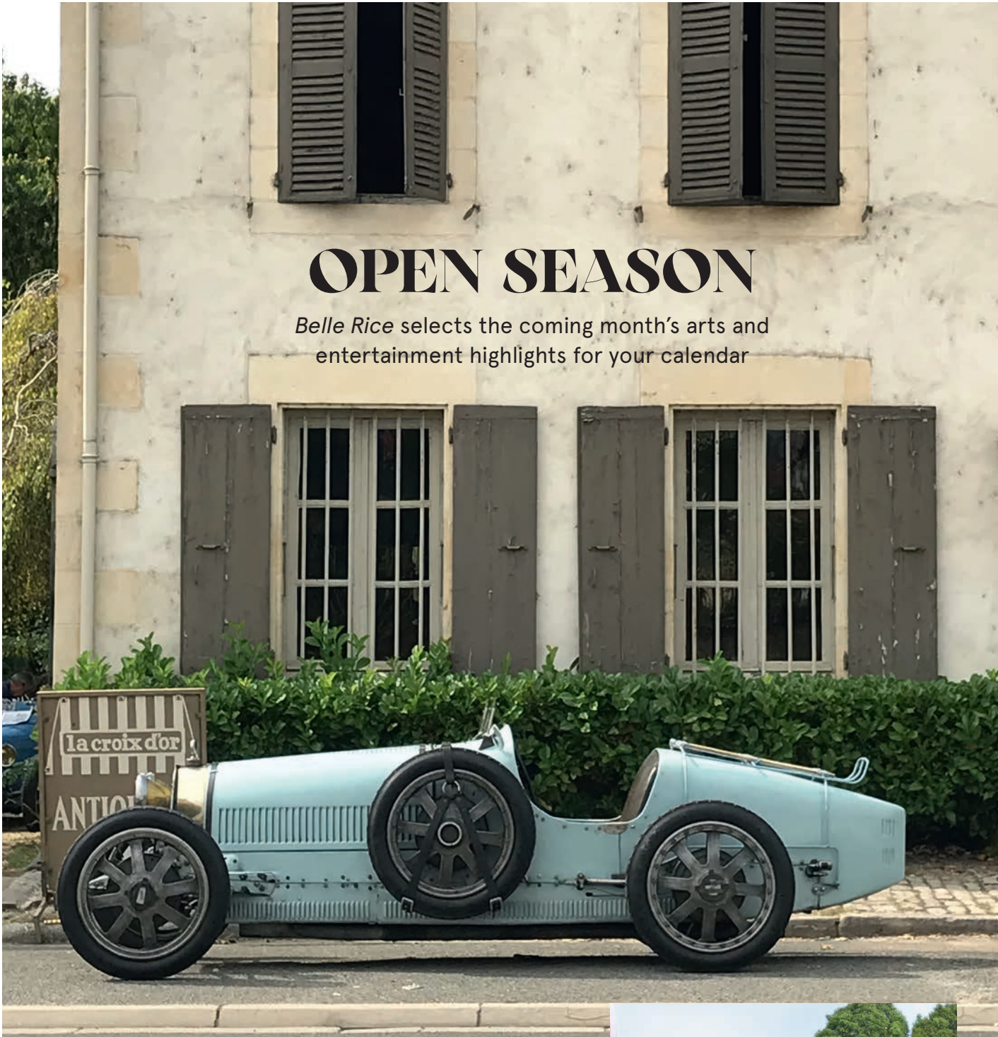
Above: The Brilliant Bugattis is a new addition to the Treasure House Fair. Right: Beaverbrook presents a hot-air balloon dining experience at the Royal Ascot