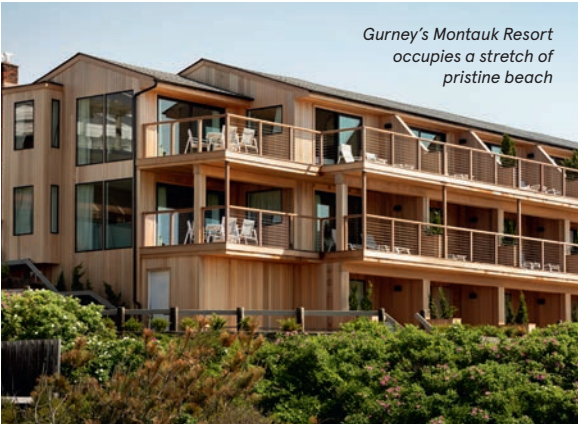
Gurney's Montauk Resort occupies a stretch of pristine beach

One of the world's best locations for sportfishing, Bermuda hosts the Triple Crown Billfish Championship, comprising the Bermuda Billfish Blast, the Bermuda Big Game Classic and the Sea Horse Anglers Club Billfish Tournament. Nine days of fishing take place during the three-series tournament, with points earned at each event for boats, crews and anglers. Registration for the Billfish Blast closes on 3 July. 3 to 21 July, bermuda.catchstat.com