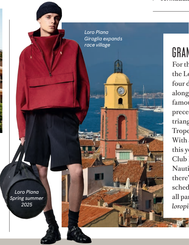
Loro Piana Giraglia expands race village