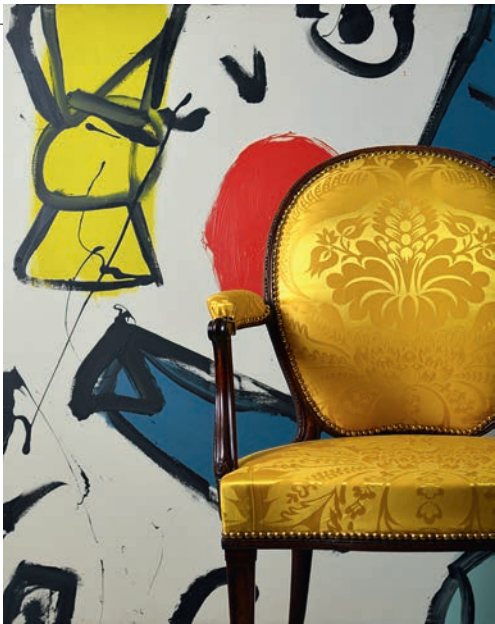
Right: Godson and Coles will exhibit 18th-century English furniture at the Treasure House Fair