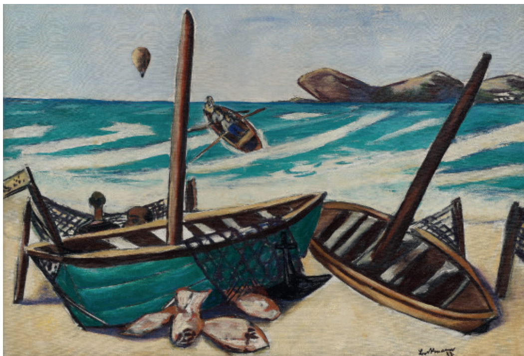
Seashore with Balloon , 1932, Max Beckmann (1884–1950), oil on canvas, 72.4 × 105.5cm. Hauser & Wirth, Basel