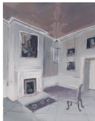
The Head Witch's House, Reception Room , 2005, Karen Kilimnik (b. 1955), oil on canvas, 35.5 × 28cm. Private collection, Switzerland. On show at Zurich Art Weekend with Galerie Eva Presenhuber

The weekend before Art Basel comes to town, it's the turn of Zurich, only an hour or so away by train, to stake its claim as a centre for modern and contemporary art. The ninth edition of Zurich Art Weekend is focused on art, naturally, but there has always been an interdisciplinary feel to the event, with talks and debates, dance performances, artist-curated club nights, food programmes and more taking place at some 70 different venues across the city. Part of the event's aim, as ever, is to strengthen the bonds between cultural spaces of different kinds, with larger institutions such as the Kunsthaus Zurich – which is holding exhibitions of work by Marisol and Kerry James Marshall – to commercial galleries, publishing houses, independent art spaces, foundations, and various corporate and private collections all taking part.