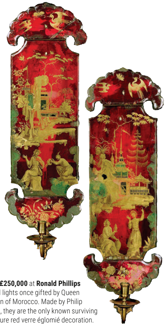
Above: priced at £250,000 at Ronald Phillips is this pair of wall lights once gifted by Queen Anne to the Sultan of Morocco. Made by Philip Arbuthnot c.1705, they are the only known surviving wall lights to feature red verre églomié decoration.