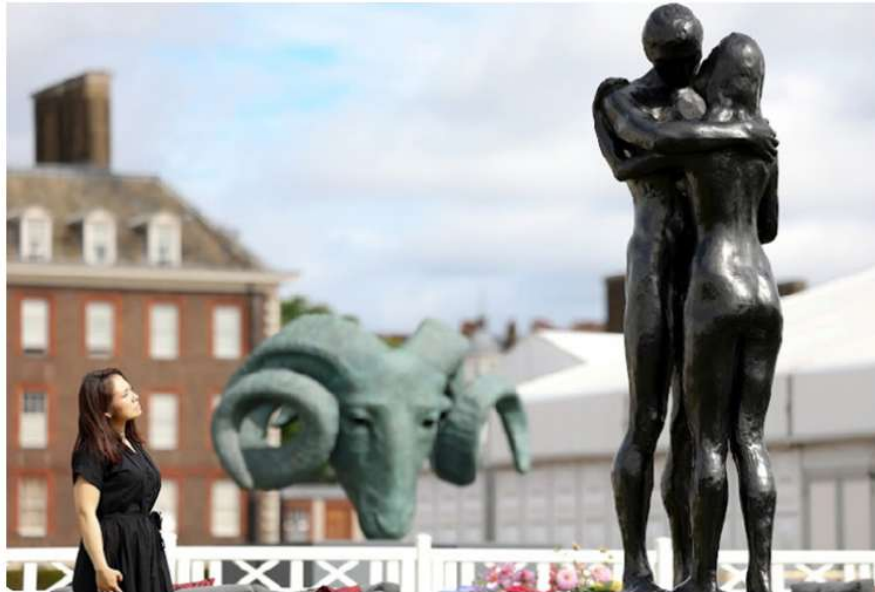
London's Treasure House Fair opened earlier this week.

Amid the heatwave sweeping the UK, exhibitors kept their cool and agreed deals in the opening hours of the evening event on June 25.