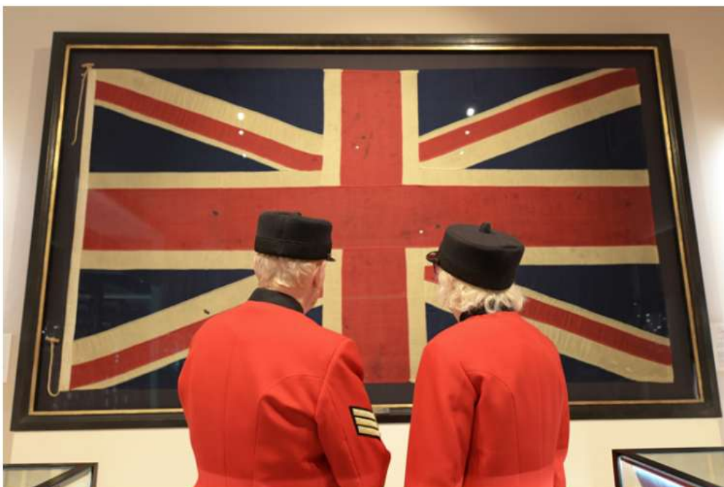
📷 Chelsea Pensioners pictured in front of a Trafalgar Union flag on the stand of Greens of Cheltenham. It has an asking price of £450,000.

Robert Young Antiques’ early sales included Dragon boat in full sail 1957 by King Charles III. A crayons on paper work by Prince Charles, aged 9, while he was at Cheam prep school. It had an asking price of £16,000.