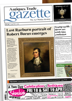
Below left: the portrait featured on the front cover of ATG No 2688.

1803 – at a fee of 20 guineas – by the publisher Cadell & Davies, the painting was to be engraved for future editions of Burns' books, but, the painting