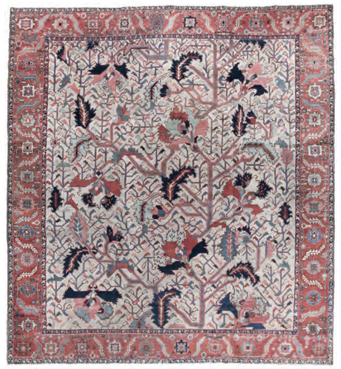
Serapi carpet. Persia, c.1880. Cotton and wool, 310 by 290 cm. KESHISHIAN, LONDON

IN JANUARY, WHEN MASTERPIECE (the last-surviving summer event of its kind in London) announced the cancellation of its 2023 fair, citing high costs and poor international exhibitor interest, the London art trade was shaken. The anxiety was mercifully short-lived when soon afterwards The Treasure House Fair was proclaimed as the new contender to take on the empty June slot. To conceive and organise a new high-stature art and antiques event in a mere six months is a remarkable feat. It will also fill the topographical shoes of Masterpiece by locating at the very same spot in the grounds of Christopher Wren's majestic Royal Hospital Chelsea.