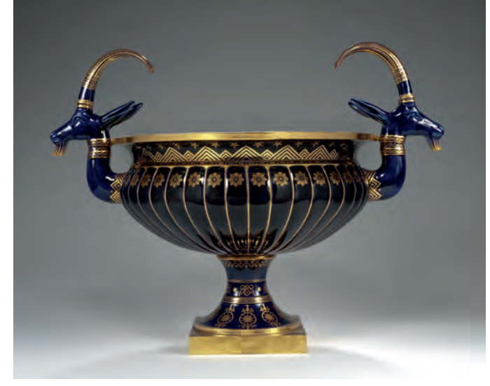
Vase , Sèvres. 1843. Porcelain, height 63 cm. MICHELE BEINY, NEW YORK