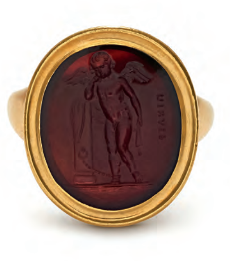
The punishment of Cupid, by Luigi Pichler (1773–1854). c.1830. Brown sard and gold, height and width of gem 2.1 by 1.8 cm. WARTSKI, LONDON