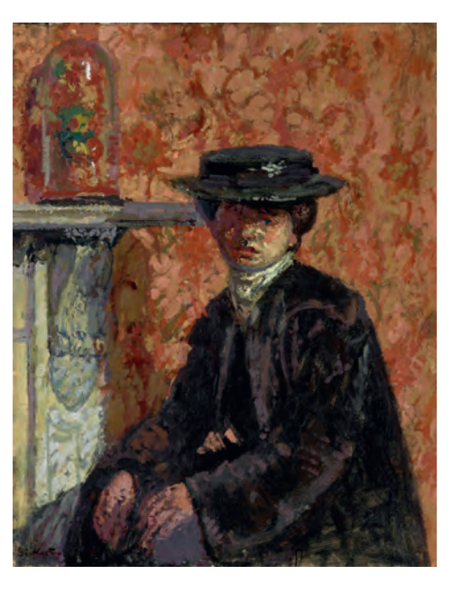
The new home, by Walter Sickert (1860–1942). c.1912. Oil on canvas, 50.8 by 40.6 cm OFFER WATERMAN, LONDON

Royal Hospital Chelsea, South Grounds, London SW3 4SR treasurehousefair.com