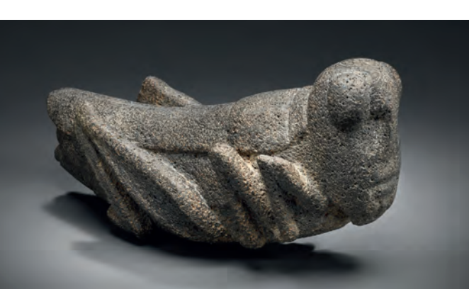
Grasshopper. Central Mexico, Aztec Culture (1325–1521). Grey basalt, length 35.5 cm. GALERIE MESTDAGH, BRUSSELS

Cake basket, by Paul de Lamerie (1688–1751). 1742. Silver, height 35.5 cm. SHRUBSOLE GALLERY, NEW YORK