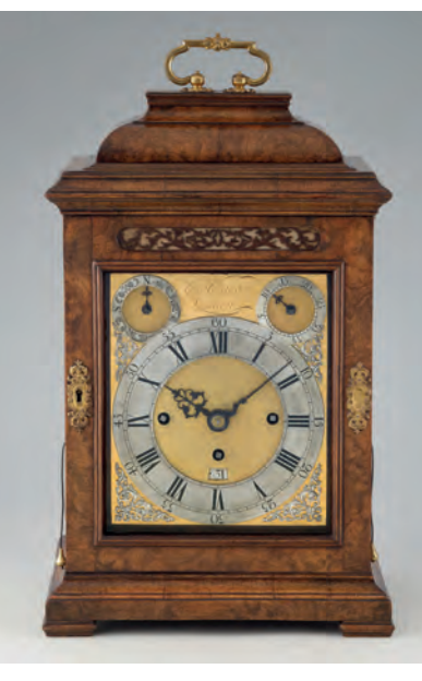
The Iberian Graham, no.722, by George Graham (1673–1751). c.1736. Walnut, silver, brass and steel, height 45.7 cm. CARTER MARSH & CO., WINCHESTER