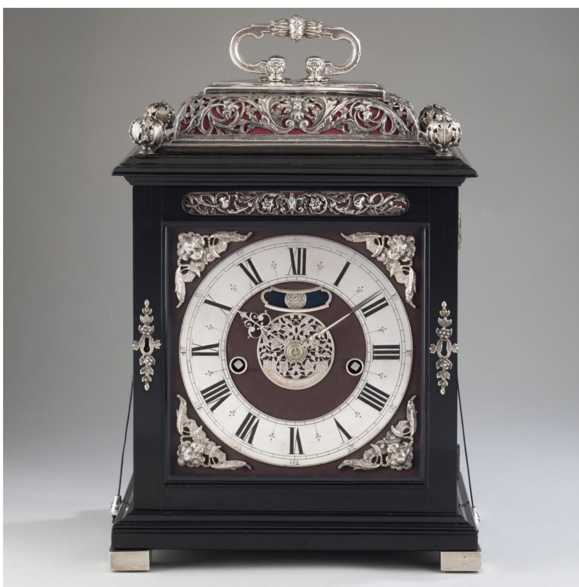
The Silver Tompion was sold by Carter Marsh for £4.5 million