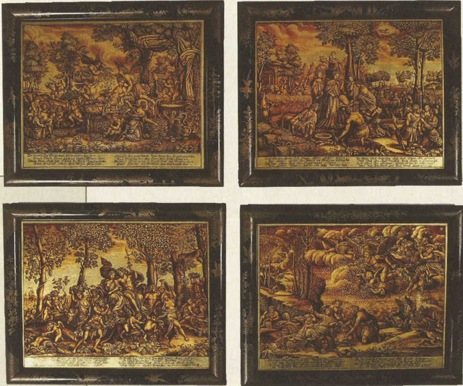
Left: E&H Manners is selling a set of four 18th century reverse glass paintings of the seasons. The scenes were created by Daniel Preissler, who was in the service of counts in eastern Bohemia. His technique involved painting the image in black and sepia and scratching in details before backing it with gold leaf. The designs are taken from a set of four engravings of the seasons by Jean de Poilly after paintings by Pierre Mignard from c.1680. They are offered together for £145,000 .