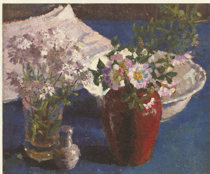
Above: Harold Gilman's Still Life: Flowers on a table , c.1909, is on offer at Piano Nobile for £165,000 . The oil on canvas is a highlight on the stand which will feature a selection of 20th century paintings, drawings, sculpture, ceramics and tapestry from artists including Waler Sickert, Duncan Grant and Frank Auerbach.

Below: available on the stand of Koopman Rare Art for £295,000 is this pair of George IV silver tureens, covers and stands from the Duchess of St Albans service.