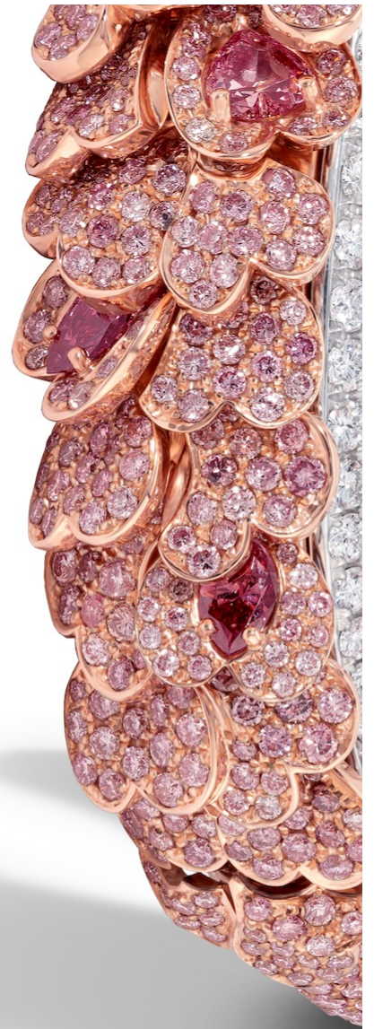
High jewellery bangle by David Morris in 18k white and rose gold, set with 9.97-carats of pink diamonds and a 6-carat D internally flawless pear shape white diamond, price on request.